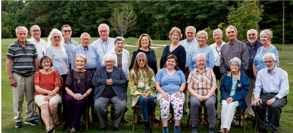
Pictured above are Monadnock Community Hospital Volunteers