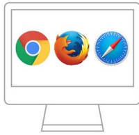
PC and Mac Chrome | Firefox | Safari

1 Use a computer or device with camera/microphone